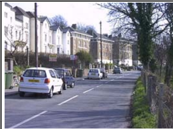
Figure 2- General view

This Area is characterised by large properties and steep hill upon which the properties are situated. Bean Road has now become somewhat of a backwater road due to the new dual carriageway built to the west, thereby relieving this section of road of through traffic. The wooded area between the dual carriageway and the Area is of prime importance as a visual and sound barrier and a local haven for wildlife. The Area is divided by Bean Road, with