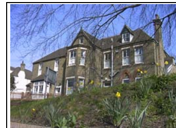
Figure 4- Other properties

Most of the properties are set back and higher than the road and are imposing both in scale and massing (Figure 4). Some properties built in the same stretch of road echo the scale of