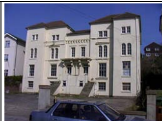
Figure 5- Other properties

On the northern edge of the Area, St. Mary's Church and the new McDonalds restaurant (Figure 6) vie for dominance in the landscape. Here there is a need to resolve the visual quality of the common boundary between the properties and the church hall to provide a more integrated landscape from the main road.