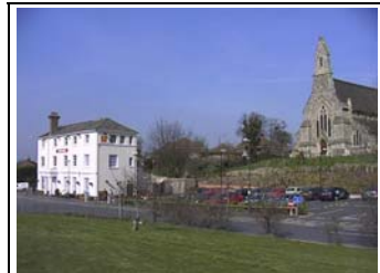
Figure 6- St. Mary's