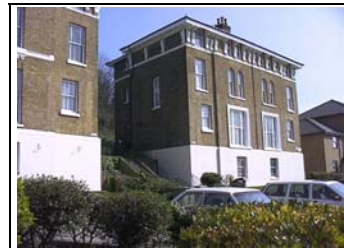
Figure 1- Ex- Blue Circle properties

They are of stock brick with large projecting eaves and rendered plinths, with a relatively shallow