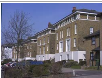
Figure 3- Loss of boundaries

pitched roof. These have now been mainly converted into flats and the front gardens amalgamated to make room for modern parking requirements, which has meant loss of some boundary walls and the individuality of the plots (Figure 3). Elsewhere the boundary wall