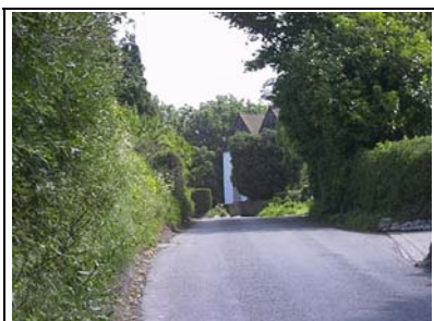
Figure 5- Rosedale

south west is the grade II listed Wastdale (Figure 1), almost hidden by a hedge. Continuing westwards the properties of Rosedale and Suki complete the Area- Rosedale forms an important terminus to the vista travelling east along Red Street (Figure 5).