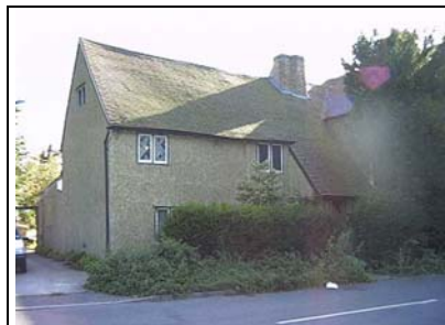
Figure 1- Wastdale

The junction with Red Street is formed by a small green complete with an old finger post sign (Figure 3). To the