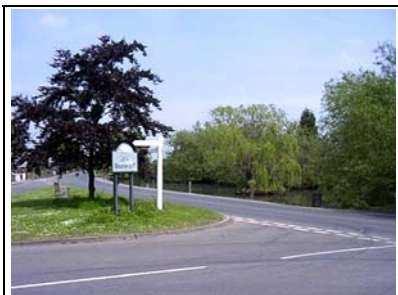
Figure 3- The green

The junction with Red Street is formed by a small green complete with an old finger post sign (Figure 3). To the