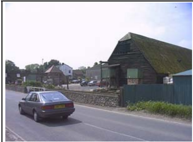
Figure 4- Manor Farm

The Broadditch Pond ASC is located around the junction of New Barn Road and Red Street, Southfleet. The current designation includes the farmyard to Manor Farm, which contains an imposing timber clad barn (Figure 4). Manor Farm House is substantially set back from the road and is almost lost behind hedges.