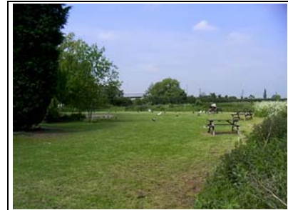
Figure 2- Picnic Area

The Area extends beyond the New Barn Road to the east, including Broadditch duck pond and a small picnic area wrapping around the rear of the pond. The road is very busy, and the provision of a small picnic area creates a small oasis off the road (Figure 2).