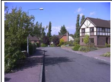
Figure 2- Backdrop

Entry into the ASRC is visually marked by a contrast in scale and open space from the surrounding housing, being more open with a lack