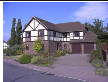
Figure 3- Form and materials

of built boundary treatment (such as walls) to the road frontage. Materials and details are consistent throughout-facing brickwork to the ground floor, render with timber detailing, or tile hanging to the first floor, and plain tiled roofs. Each house has a varying