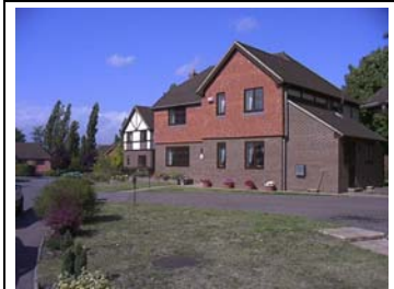
Figure 4- Form and materials

of built boundary treatment (such as walls) to the road frontage. Materials and details are consistent throughout-facing brickwork to the ground floor, render with timber detailing, or tile hanging to the first floor, and plain tiled roofs. Each house has a varying