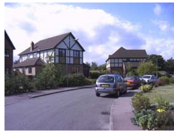
Figure 1- Entry into the ASRC

A development of large detached houses built in 1990, Chaucer Park ASRC is situated on the escarpment to East Hill and commands fine views overlooking the town centre. The development is reached through Sterndale Road and East Hill Drive, which are of more modest scale and mixed period. The northern and eastern boundaries are formed by woodland, creating a pleasant treed backdrop to the development. The boundary to the west