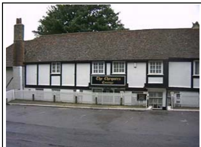
Figure 6- The Chequers

contribution (Figure 2), which leads to the grade II listed Mill House (Figure 5) and the Chequers public house (Figure 6). Mill House has been encroached upon by works buildings, but the Chequers has a garden at the rear which gives some of the sense of the historic landscape overlooking the Darent valley.