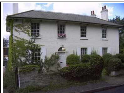
Figure 5- Mill House

In comparison to the southern side of Darenth Hill, Darenth Road is a narrow space squeezed between the wall Rose and Gordon Cottages. The trees along Darenth Road provide a real