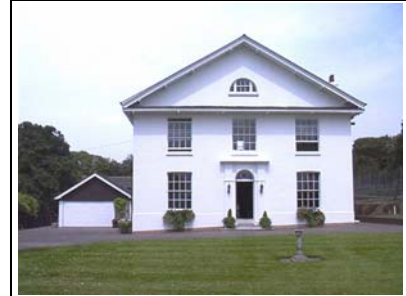
Figure 4- Darenth Court

from the often busy Darenth Hill. The adjacent fruit distribution depot detracts in the immediate vicinity, but being well set back from the road, only the wide concrete access is apparent.