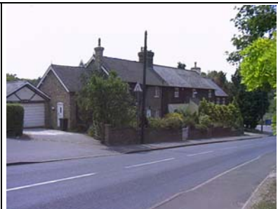
Figure 1- Court Cottages

Unfortunately any historical link these buildings had with the riverside has been lost due to the depot. Court Cottages provide a contribution to the road frontage (Figure 1).