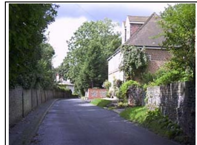
Figure 2- Darenth Road

Unfortunately any historical link these buildings had with the riverside has been lost due to the depot. Court Cottages provide a contribution to the road frontage (Figure 1).