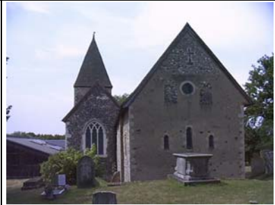
Figure 3- St. Margaret's Church

This Area of Special Character is very much defined by Darenth Hill, which bisects the two halves of the Area. In the southerly section lies the listed grade I Church of St. Margaret (Figure 3) and the listed grade II Darenth Court (Figure 4). The extensive graveyard and the grounds of Darenth Court provide appropriate settings for these fine buildings, tucked away