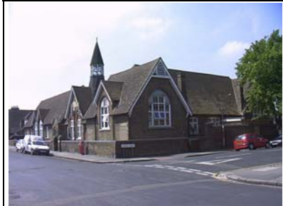
Figure 1- St Albans School

Road Primary School, St. Albans Hall and the