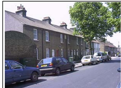
Figure 4- Progress Terrace

local Co-Op shop to warrant the status of ASC.