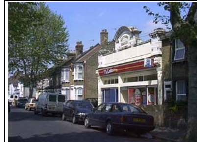
Figure 2- Colney Road Co-Op