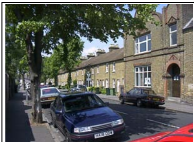
Figure 3- Unity Terrace