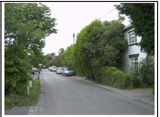
Figure 6- Landscaping

that part of Red Street that runs east to west and which is covered by conservation area designation. The coherence and grouping of