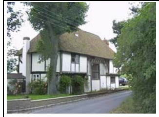
Figure 5- Chapter Farm House

There is more variation and interest in the character of