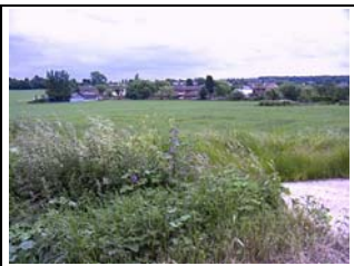
Figure 1- Views east from Red Street

Red Street is sufficiently distinct to treat it in two parts- that running south from the junction with Warren Road (outside the designated conservation area), and that running east-west (within the conservation area). That part of Red Street from the village centre southwards is generally