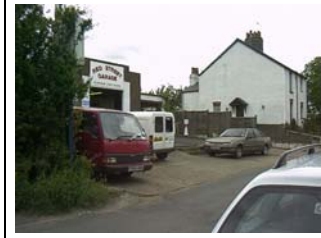
Figure 10- Red Street Garage

(Figure 9) and the Red Street garage workshop add further variety to the townscape (Figure 10).