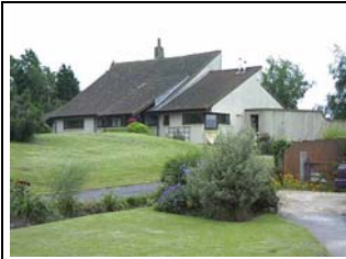
Figure 8- Fillbaskets

The townscape quality is apparent, with properties close to the highway (such as the Dean and Chapter Cottages). There are also variations in style, with a