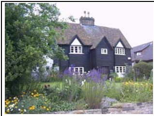
Figure 3- Old Ship Cottage

predominantly either detached bungalows or large two storey brick