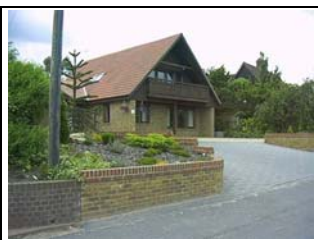
Figure 2- Built form in the northern part of Red Street

open in character with views of open countryside eastwards (Figure 1). Landscaping is mainly ornamental in nature with shrubs and bushes and few mature trees. The properties are residential -