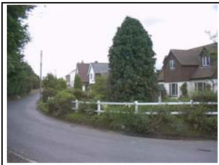
Figure 4- Corner of Red Street looking north

houses set back from the road (Figure 2). The majority make neither a positive or negative contribution to the area, although there are exceptions such as the grade II listed Old Ship Cottage (Figure 3) dating from the 17 th century.