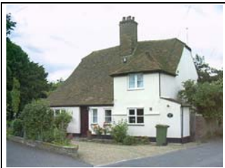
Figure 11- Red Street House

However, there are four Grade II listed buildings and one Grade II* property within the Conservation Area. Chapter Farm House is a good example of a two storey Wealden hall house dating from the 15 th century, with a timber frame and lath and plaster infill (Figure 5). The Black Lion public house dates from the