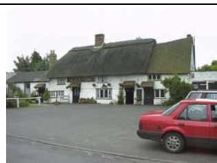
Figure 9- The Black Lion Public House

mix of bungalows, Victorian houses, flats, cottages and semi-detached modern houses. In general the unlisted and contemporary buildings such as Fillbaskets ( Figure 8) add to the quality and interest of the area. The Black Lion public house