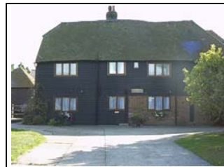
Figure 12- Hall's Cottage

weatherboarded former granary behind Hall's