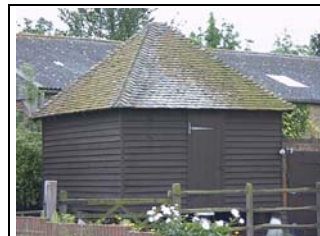
Figure 13- Granary, Hall's Cottage

The remainder of the area consists of mainly domestic properties spanning from Victorian to mid 20 th