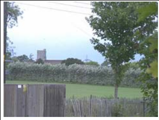
Figure 7- Views north west towards St. Nicholas's Church

The townscape quality is apparent, with properties close to the highway (such as the Dean and Chapter Cottages). There are also variations in style, with a