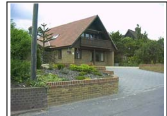
Figure 2- Built form in the northern part of Red Street

In contrast, the buildings along Hook Green Road tend to be large detached properties such as Friary Court and The Old Friary (Figure 7), Withens and The Rectory, all set within their own grounds with mature landscaping.