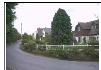
Figure 4- Corner of Red Street looking north