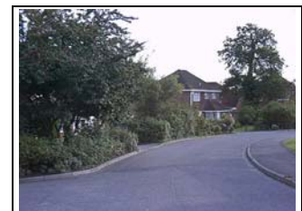
Figure 6- Sedley