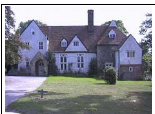
Figure 7- Friary Court

Red Street is generally open in character with views of open countryside eastwards (Figure 1). Landscaping is mainly ornamental in nature with shrubs and bushes and few mature trees. The properties are residential- predominantly either detached bungalows or large two storey brick houses set back from the road