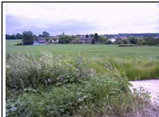
Figure 1- Views east from Red Street

The Southfleet ASRC has two distinctive parts, that of Red Street from the village centre southwards to the boundary of the conservation area, and the part containing Sedley, Rectory Meadow, Monks Walk and Hook Green Road.