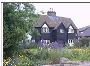
Figure 3- Old Ship Cottage