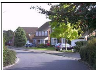
Figure 5- Monks Walk