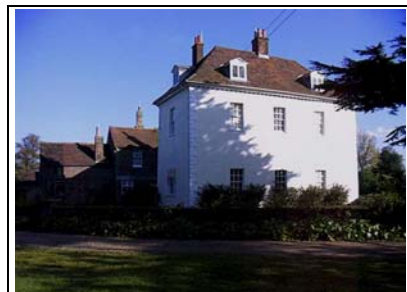
Figure 2- The house from the bridge

the site, the orchard insulates the traffic noise and one is not really aware of the surrounding development along Main Road .