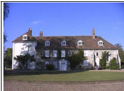
Figure 3- The house from the south

The majority of the gently sloping western area, up to the stream and listed bridge bisecting the site, is open with few trees.