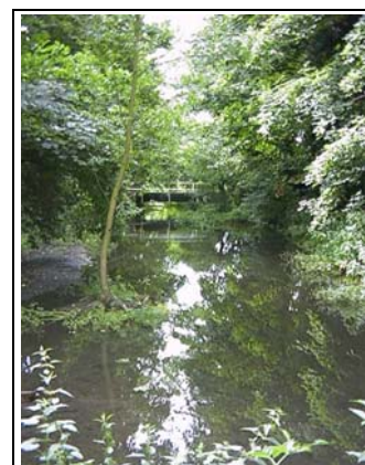
Figure 6- The old moat

eighteenth and nineteenth centuries (Figure 3). A past resident was Abraham Hill, a founder of the Royal Society.