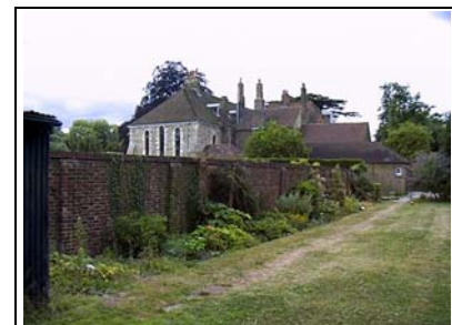
Figure 4- The walled garden

The track leading from Main road to the bridge provides a good oblique view of the St. Johns Jerusalem set beyond the bridge (Figure 2).