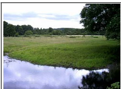
Figure 5- View towards the watercress beds

The house itself is of major importance to the borough, and contains the remains of a chapel of the preceptory of the order of the Knights Hospitallers of St. John Jerusalem founded here in 1199. The main portion of the building dates from the thirteenth century whilst the remainder is