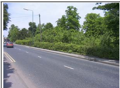
Figure 1- The orchard

St. John's Jerusalem is situated to the north of Main Road, Sutton at Hone and occupies a large tract of land linking Main Road to the countryside beyond. The main site is effectively screened from the road by an orchard which runs adjacent to the road (Figure 1). From within