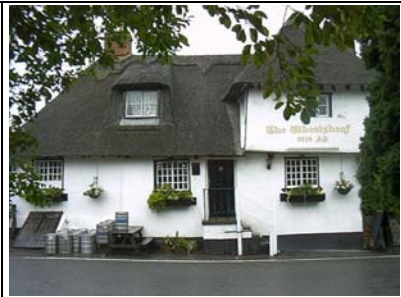
Figure 3- The Wheatsheaf

the area, but the listed ex- farm buildings are gradually being repaired and improved, and the well defined boundaries confining