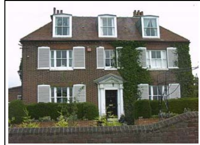
Figure 2- Westwood House

Several listed buildings are situated within Westwood Farm (Figure 4). Here the working environment as a small trading estate detracts from the overall character of