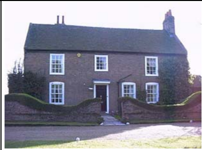
Figure 1- Ivy House

Westwood Area of Special Character is set within the green belt, to the west of Betsham and consists of the linear development along Highcross Road. There are a number of pleasant individual buildings within the Area along Highcross Road, including three Grade II listed buildings- Ivy House (Figure 1), Westwood House (Figure 2) and The Wheatsheaf public house (Figure 3).