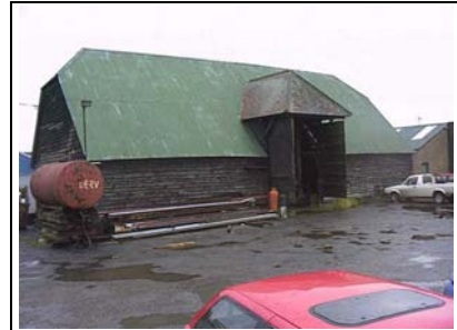
Figure 4- Westwood Farm

the area, but the listed ex- farm buildings are gradually being repaired and improved, and the well defined boundaries confining